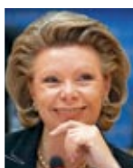
VIVIANE REDING VICE-PRESIDENT, JUSTICE, FUNDAMENTAL RIGHTS AND CITIZENSHIP EUROPEAN COMMISSION