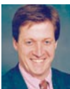
ALASTAIR CAMPBELL FORMER SPOKES- PERSON, BRITISH LABOUR PARTY