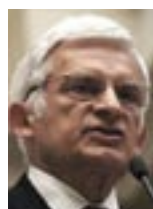
Jerzy Buzek President, European Parliament 03.07.1940